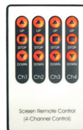
4-Channel Infrared Remote Control

Important Note: After termination, if motor does not move. Reset by switch on and off the incoming supply.