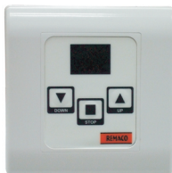
Electronic Screen Control (ESC)