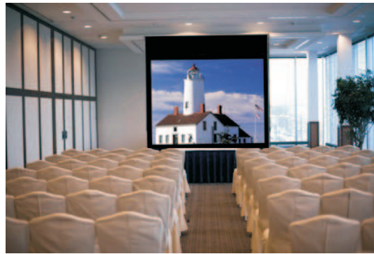
Video Format Screen with 4 sides black border