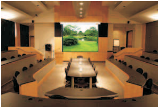
Screen with 3 sides black border