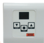
Electronic Screen Control (ESC)