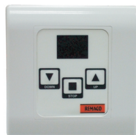
Electronic Screen Control (ESC)

(Warranty void if damaged is caused by inappropriate use.)