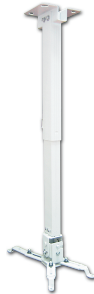
PSB-10 & PSB-20

Remaco PSB-30 & PSB-31 comes with a newly yet different body-build universal mounting spacer. Made of high quality metal to enhance its structure, you can set off your mind to entrust your projector bracket. It is so flexible that their adjustable spider arm fits most LCD/DLP projectors on the market.